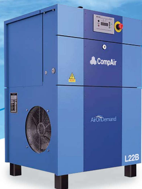
L15B - L22B Series