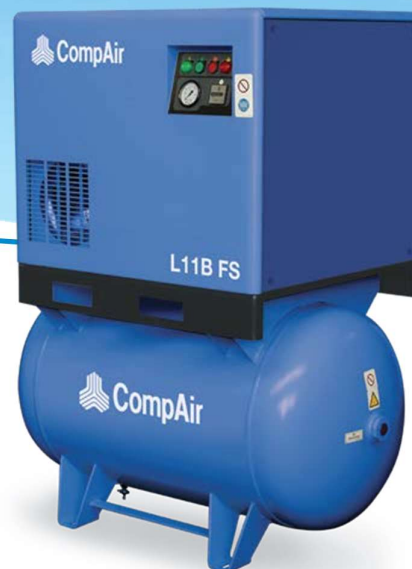
L07B - L11B Series