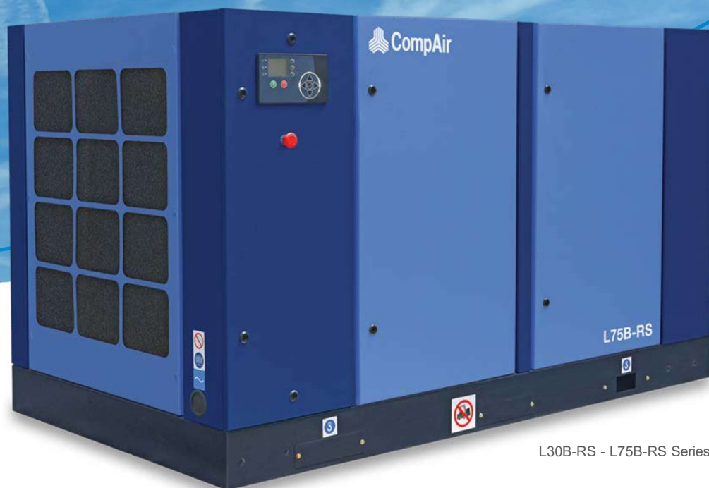
L30B-RS - L75B-RS Series