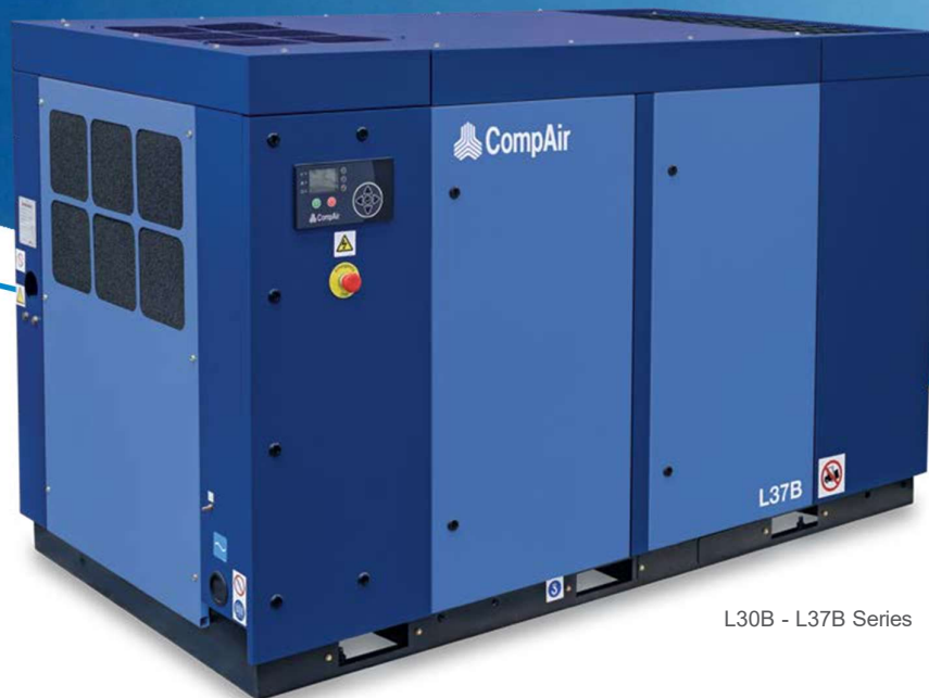
L30B - L37B Series