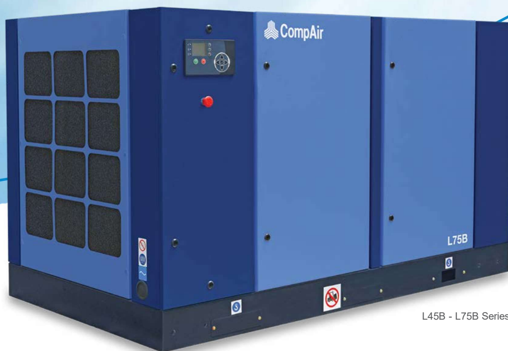
L45B - L75B Series